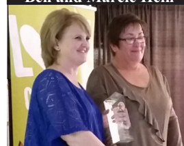
Crazy Beanz Bistro