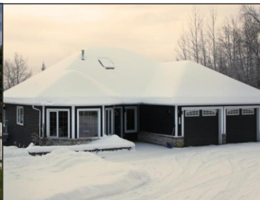
5301 HILLSIDE AVE