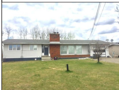
4709 46 STREET