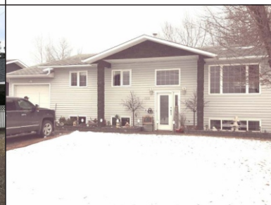
5118 43A STREET