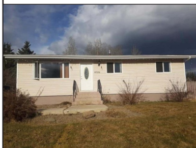
4728 45 STREET