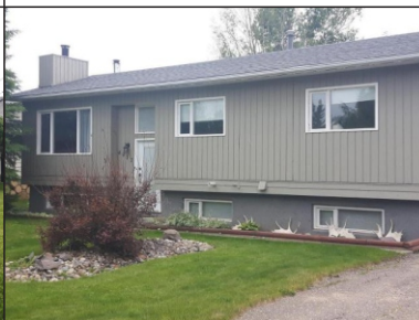
4917 44 STREET