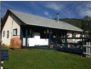
1963 MEDICINE WOMAN