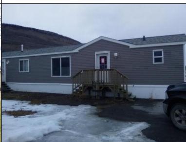
64 - 6549 WILDMARE SUB