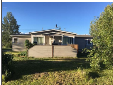
1 & 2 - 4740 48A STREET