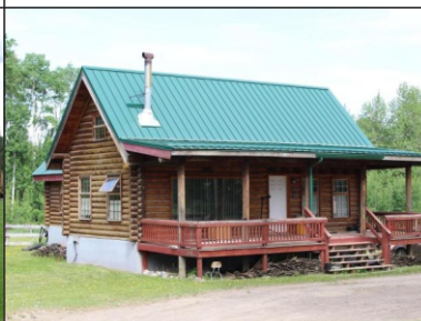
6558 WILDMARE ROAD