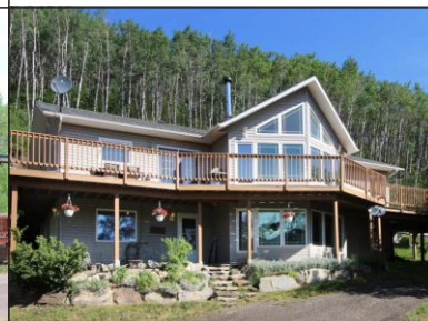
6410 CAMPBELL ROAD