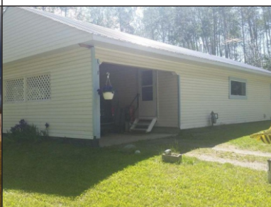
6016 WESTALL ROAD