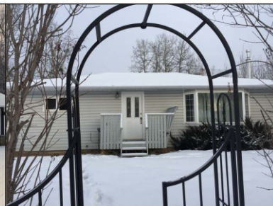
5100 45 PLACE