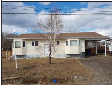
4112 52A PLACE