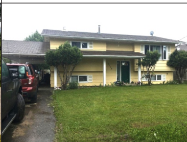
5218 42 STREET