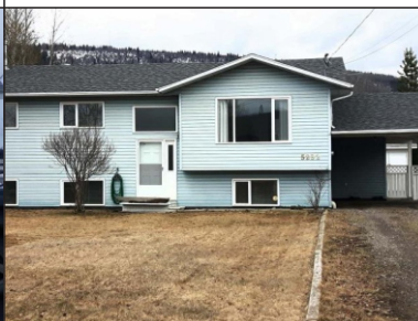
5232 43 STREET