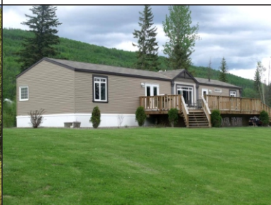
3064 CLARY ROAD