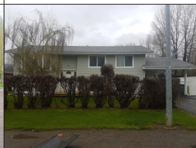
4800 51A AVE