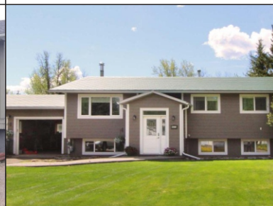
4513 47 AVE

Thanks for all your support in 2017, look forward to a great 2018 To see your house on the 2018 SOLD, give me a call.