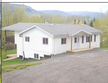
5983 KURJATA ROAD