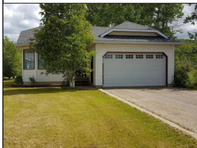
5222 40 STREET