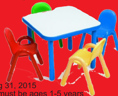
Table w/ 4 chairs Art Supplies and MORE!

July 1 ~ Aug 31, 2015 Preschool must be ages 1-5 years