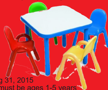
Table w/ 4 chairs Art Supplies and MORE!

July 1 ~ Aug 31, 2015 Preschool must be ages 1-5 years