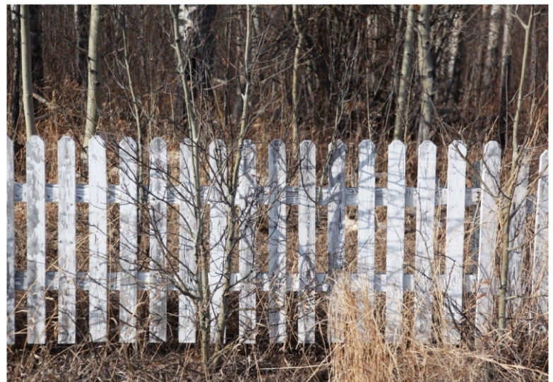
A detail of Lifeline.

A burial will take place at a later date.