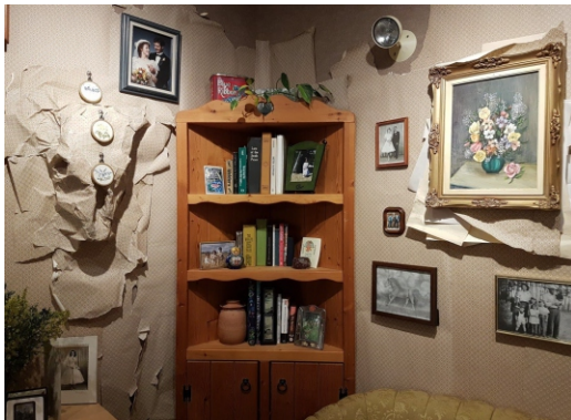
A detail of Memory Palace, a mixed-media installation by Haley Bassett

HB: In Lineage , I used my total body of work, including drawings from my early childhood all the way up to my current work, to explore how we come to be who we are, making this show a retrospective of sorts. Seeing as it's admittedly early for me to have a retrospective (I am not yet 30), I wanted to look into my pre-history, or my family's history, to discover how the forces that shaped my ancestors' lives continue to shape my own. The Peace Country is a large component of that. It was a long road, but both sides of my family eventually settled here following winding histories of displacement and upheaval. It's so unlikely that they found themselves in the Peace, and so random that I exist. So in that way, I consider those histories, and this land, to be a part of me.