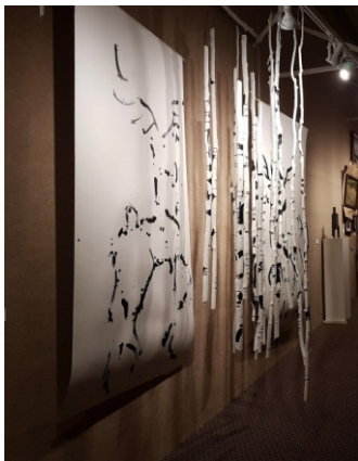
In Hindsight, an installation with aspen poles, ink, vellum and thread by Haley Bassett

SF: What is the meaning behind your hanging installation with the poplar trunks?